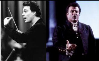
YVES ABEL Conductor