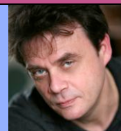
OTTAVIO DANTONE Conductor