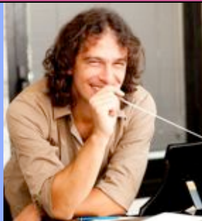
FRANCESCO LANZILLOTTA Conductor